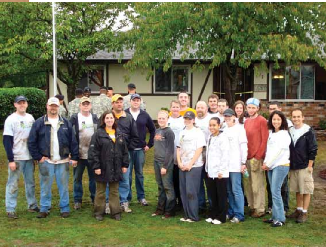
The wonderful volunteer team.