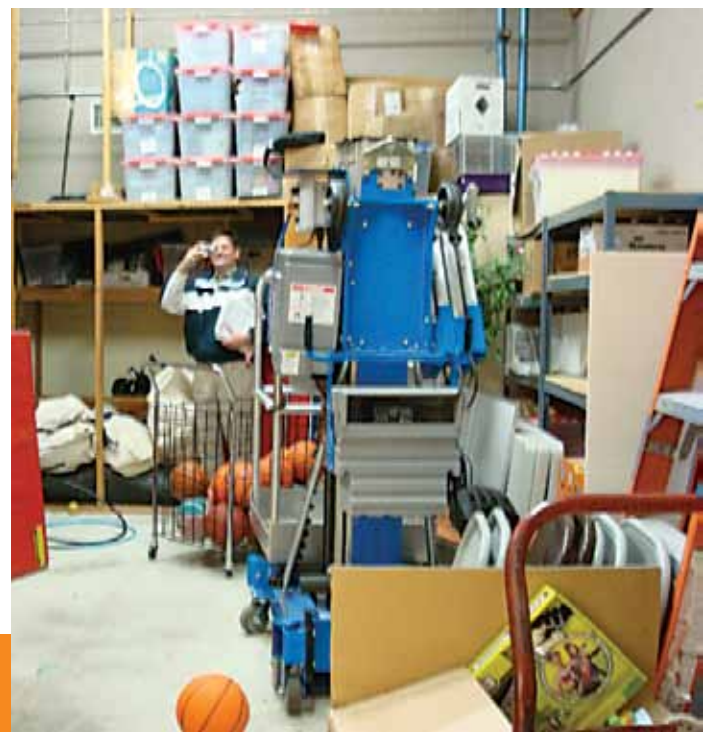
Storage space before renovation