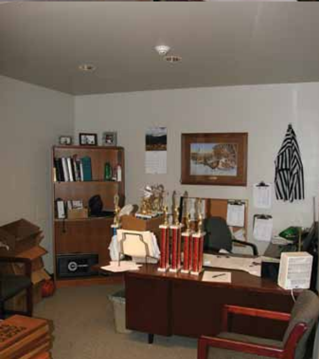
Seattle Seahawks paint the gymnasium.

Parker Paint Construction Unlimited, Inc. Gluth Contract Flooring PCI Democon Scott Coatings Standard Steel Stellar Structures Sunbelt Rentals