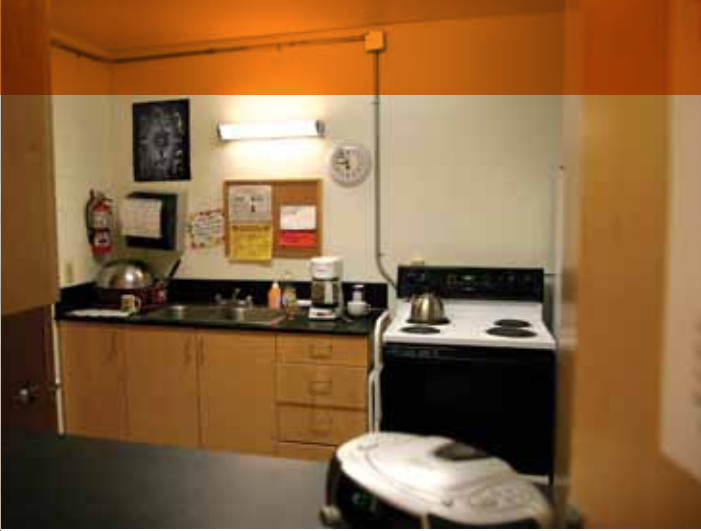
Kitchen before renovation