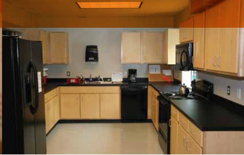
Kitchen doubled in size and received new appliances!