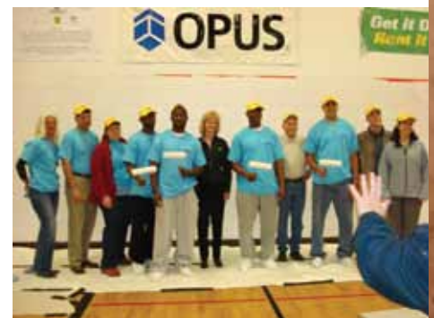
Seattle Seahawks volunteers and Opus NW project leaders.