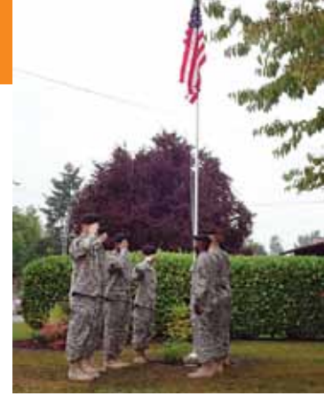
The flag raising ceremony